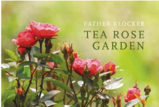
FATHER KLOCKER TEA ROSE GARDEN